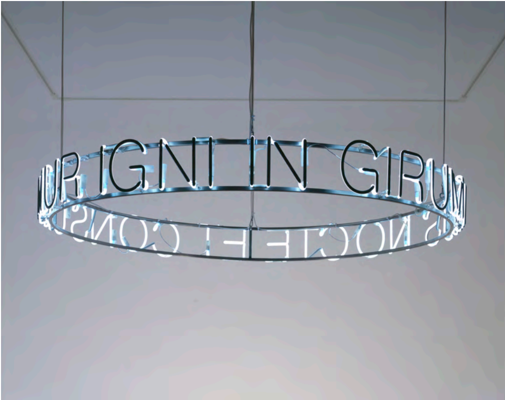
Cerith Wyn Evans, In girum imus nocte et consumimur igni, 2008, neon, metal, cable, plexiglass, 20 × 185 cm, courtesy the artist & Galerie Neu, Berlin