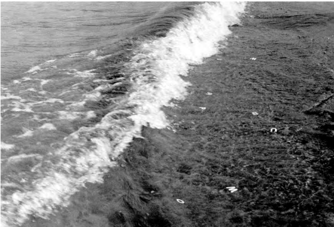
Ewa Partum, Active Poetry. 1971–1973, 8mm film transferred to DVD, b/w, 5:45 min, video still, courtesy the artist & Galerie M + R Fricke, © Ewa Partum